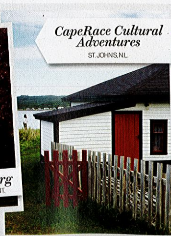
CapeRace Cultural Adventures ST. JOHN'S, N.L.