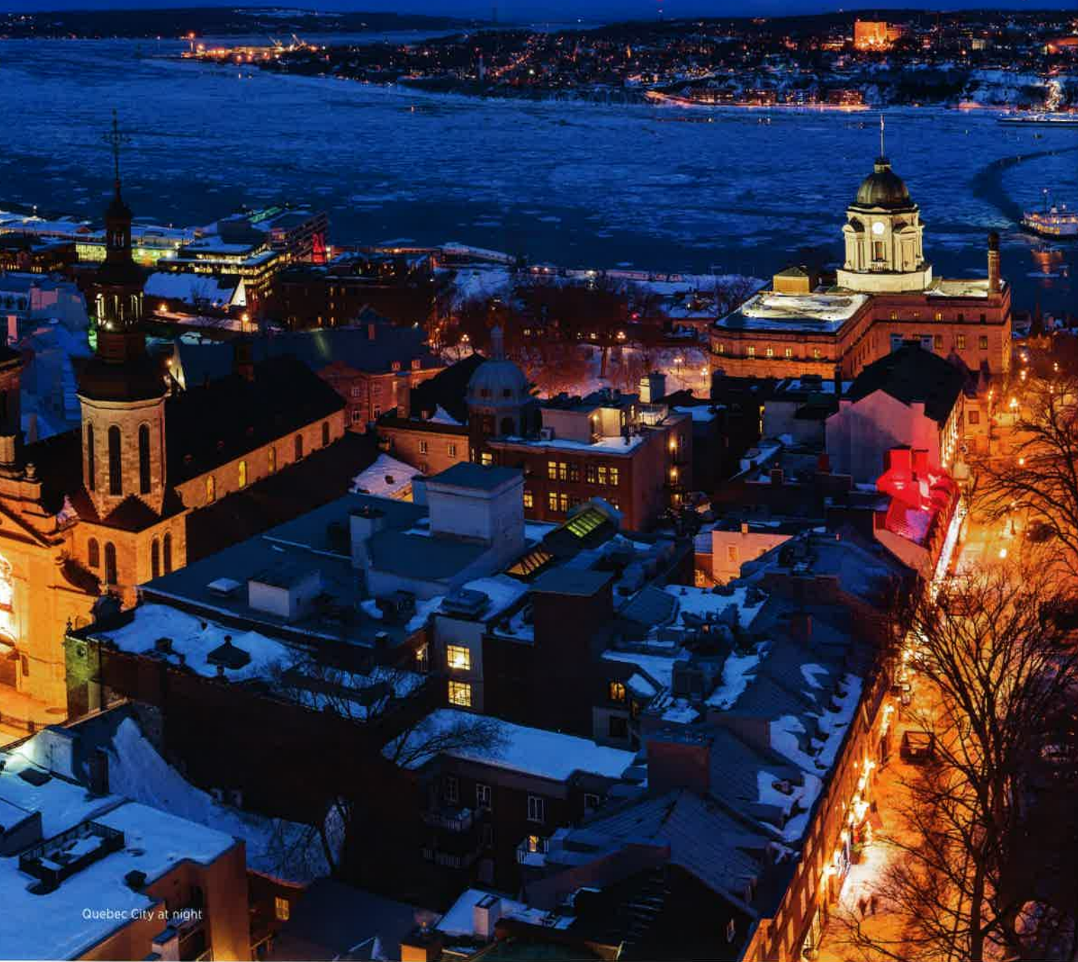
Québec City at night