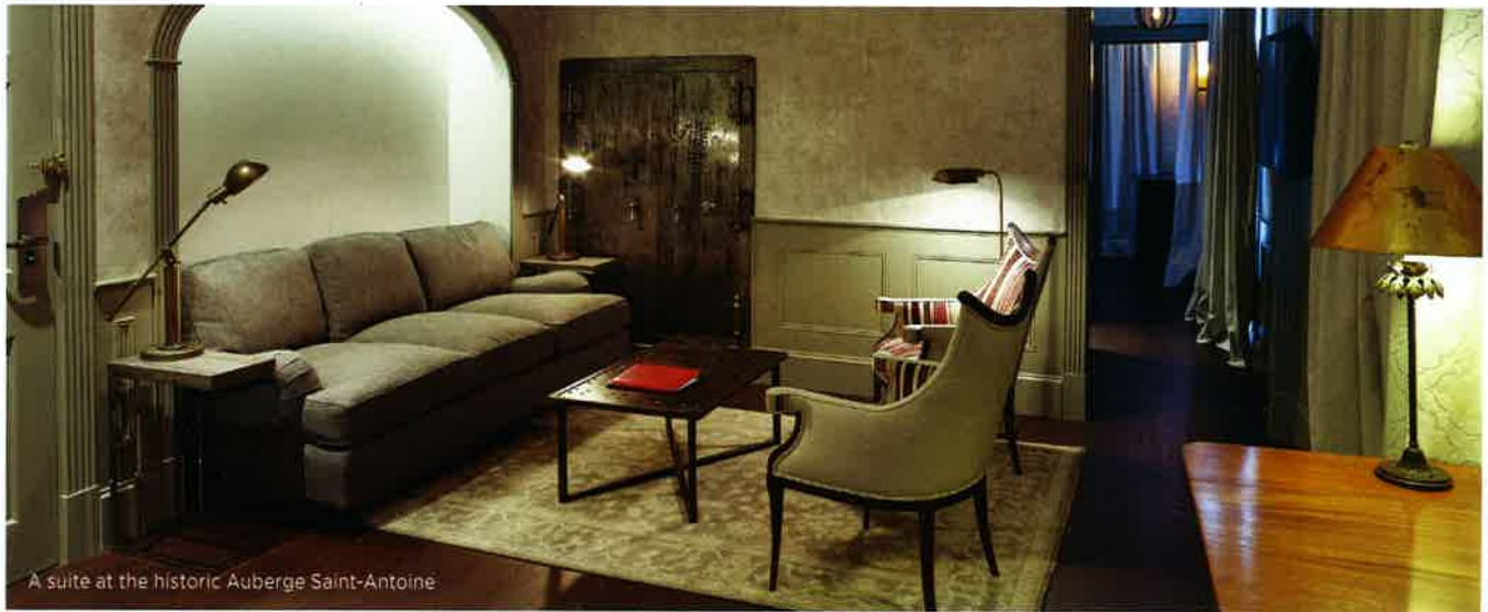
A suite at the historic Auberge Saint-Antoine

Just remember, this is a French-speaking city so French first, always, even it's just bon jour and merci . Ready to keep going? Allons y!