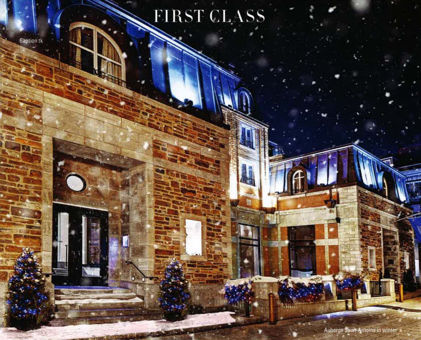
Auberge Saint-Antoine in winter