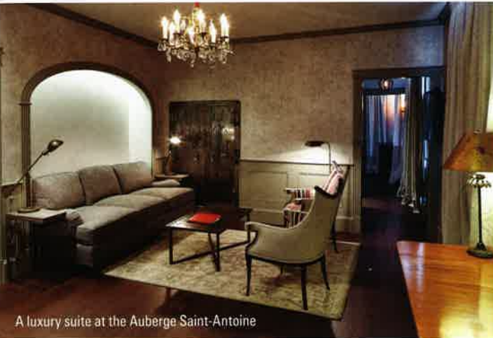
A luxury suite at the Auberge Saint-Antoine