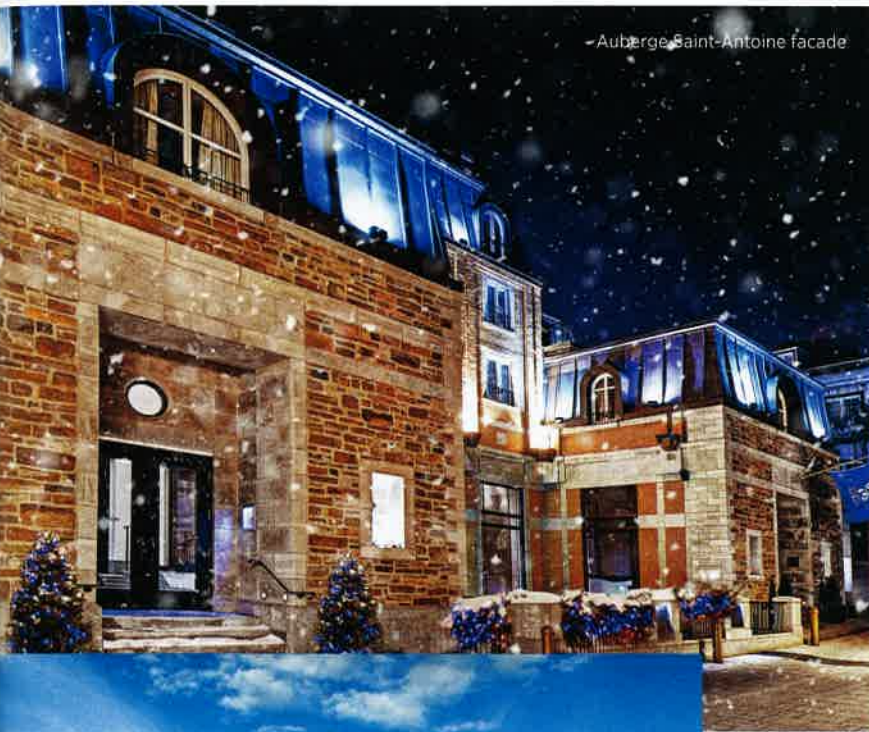
-Auberge Saint-Antoine facade

ride itself is quick but well worth it to avoid walking the 45-degree incline up the hill where you can see the iconic Le Château Frontenac (one of a series of “castle hotels” built by Canadian Pacific Railway tycoons in the 1920s), the Musée du Fort military museum ( museedufort.com ), and enjoy panoramic views of the St. Lawrence River. While there is a similar funicular system in the Montmartre region of Paris, there is said to be nothing else like it in North America ( funiculaire-quebec.com ).