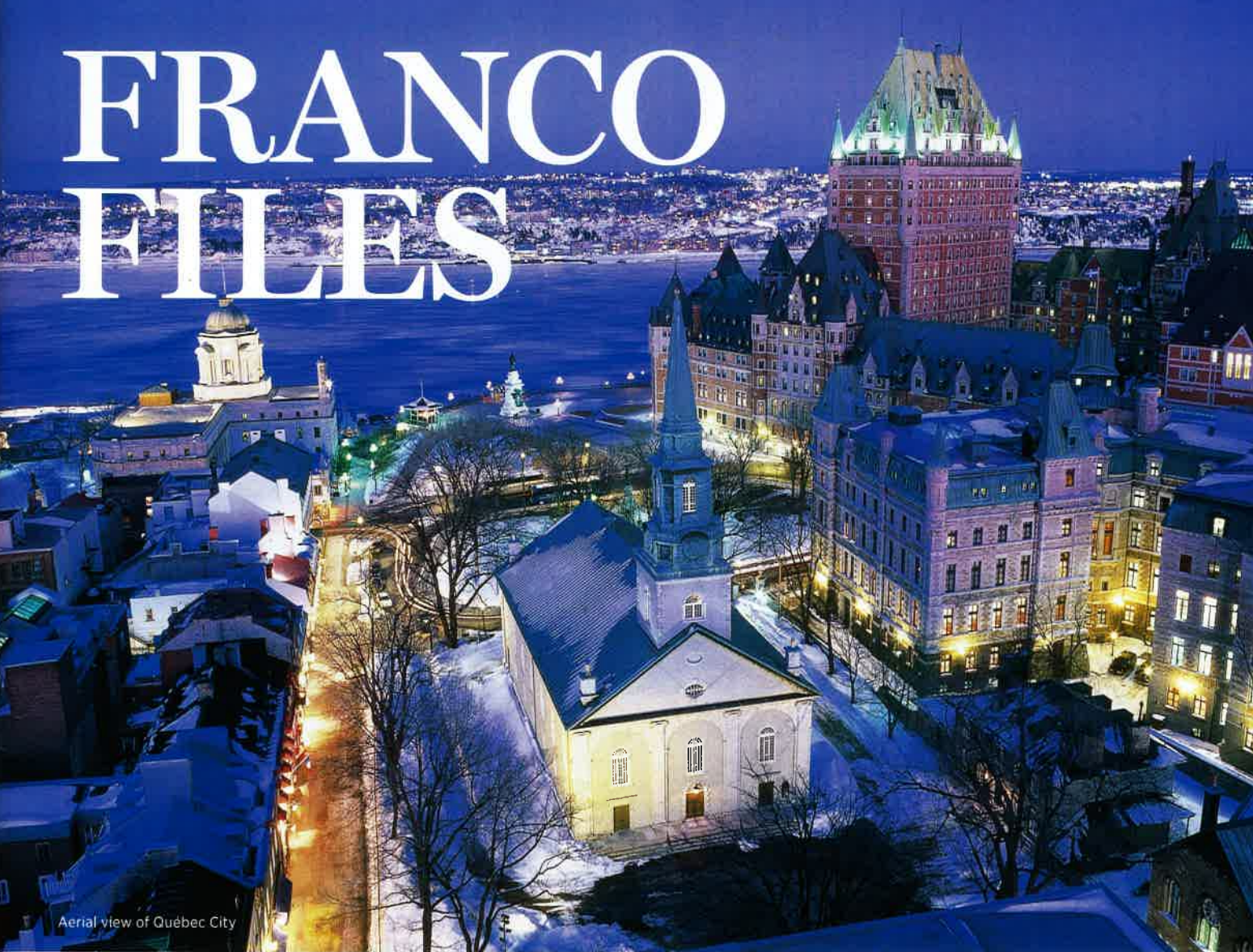
Aerial view of Québec City

Québec City's luxurious Auberge Saint-Antoine is the ultimate site to explore the 410-year history of the only walled city north of Mexico.