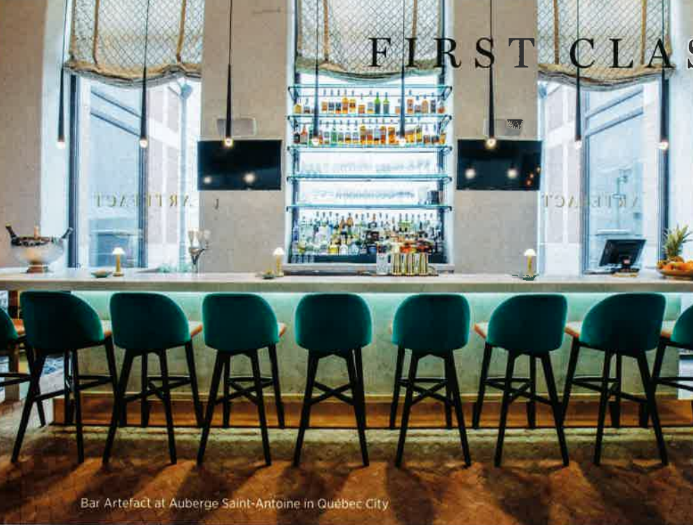
Bar Artefact at Auberge Saint-Antoine in Québec City

were pioneering women, many who left families in France as teenagers to sail across the ocean to help settle the new world. Today, the monastery operates as a hotel, health spa, organic restaurant, and nonprofit heritage and cultural center. Guests can stay in humble rooms accoutered just the way they were for the sisters for hundreds of years. This is often attractive for groups who seek meditation or yoga retreats with no distractions ( monastere.ca ).